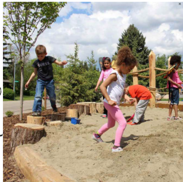
Sand area w/ log steppers